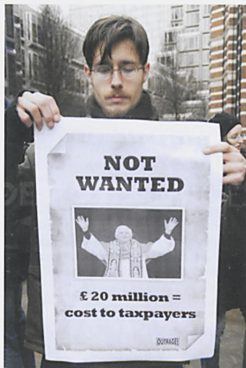
A protester at one of the first demonstrations in London against Ratzinger's visit