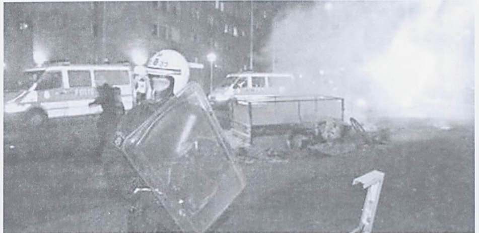
In 2008, Muslims set fire to buildings in Malmö when a landlord decided not to renew the lease of a basement that was being used as a mosque. Cars and garbage bins were also set ablaze and stones were thrown at police in violent clashes over a two-day period

They asked: "Are you a Jew?". When he said "yes" they threatened to drag him into the woods and hang him. The family moved to another district, but experienced