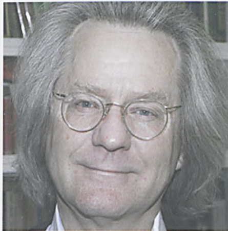
Professor A C Grayling

ACG: Usually people who say that are quite ignorant of what's involved in scientific research and of the wonder, the beauty, the amazement that comes out of