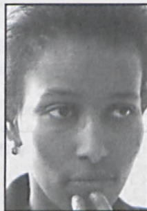
Ayaan Hirsi Ali

"In a series of 'Letters to Hirsi Ali' published this spring in the newspaper De Volkskrant , several well-known, mostly male writers charged her with poisoning the political atmosphere with her strident attacks on