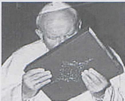
This photograph of the late Pope John Paul II kissing a Koran enraged fundamentalists around the world. By kissing it, they said, he symbolically accepted its doctrine that rejects the Holy Trinity and the divinity of Jesus

"The Koran, however, differed radically from other sacred books. They were inspired by God, but the Koran was the very word of God , and in the language that God clearly