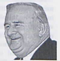
Pastor Harry Hardwick

Those of you with even halfway-tuned bullshit detectors will have realised that Hardwick's sermon is pure spoof. Indeed, it will come as no surprise that the pastor does not exist at all – he is a creation of Landoverbaptists.org , a highly-sophisticated website set up to parody Christians the world over.