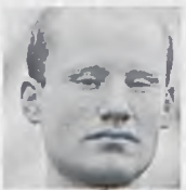
Van der Graaf