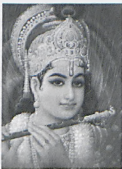
Krishna, Hinduism's supreme deity

The Bhagavad Gita (BG) consists of a dialogue between Krishna, the supreme deity in human form, and Arjuna, a member of the warrior class, just before a big battle is about to begin. Arjuna is refusing to fight because he does not want to kill the