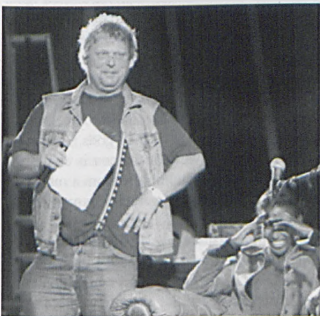
Van Gogh and Hirsi Ali pictured during a debate a few days before his murder

The man now awaiting trial for the murder is